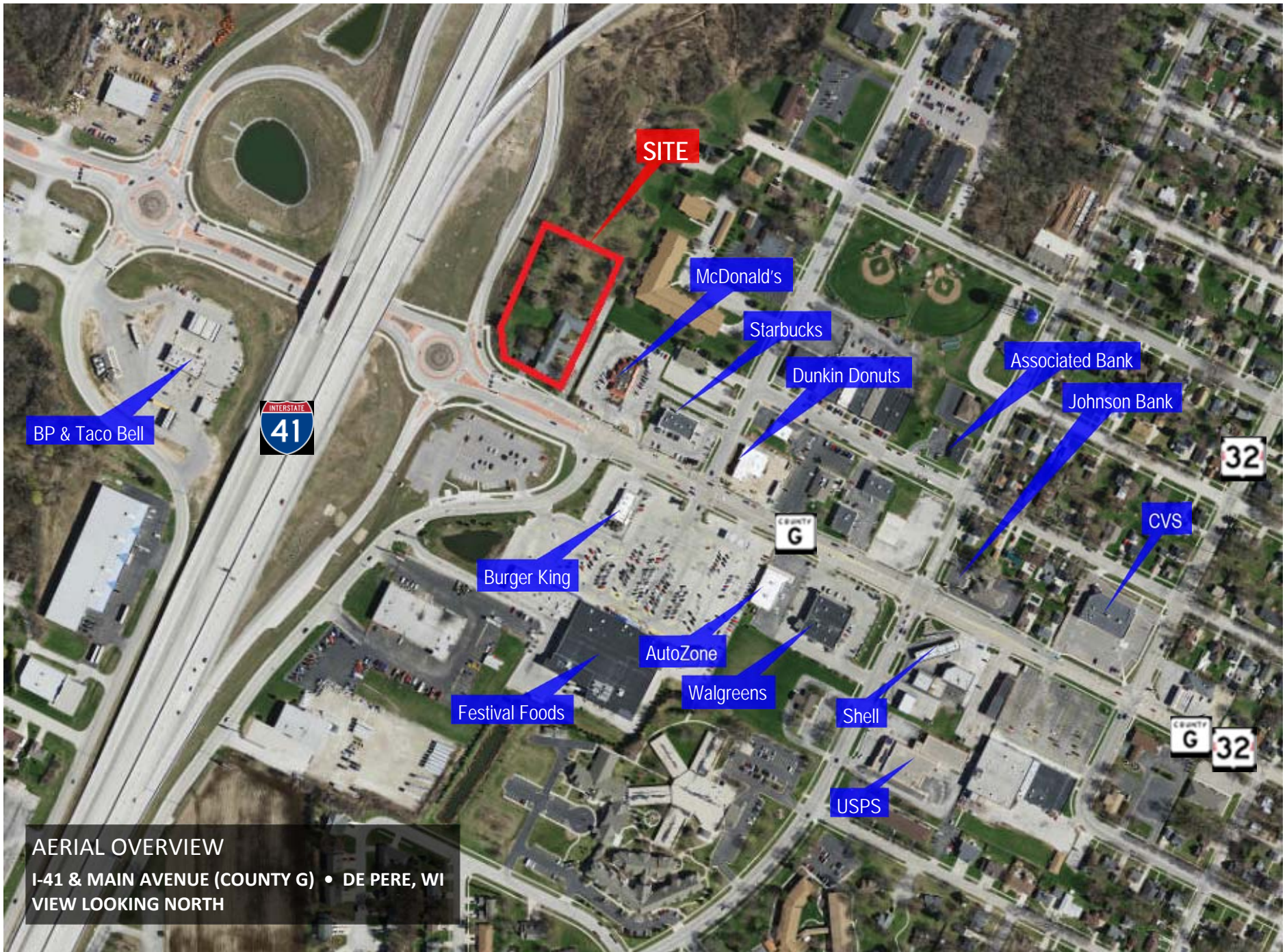
AERIAL OVERVIEW I-41 & MAIN AVENUE (COUNTY G) • DE PERE, WI VIEW LOOKING NORTH